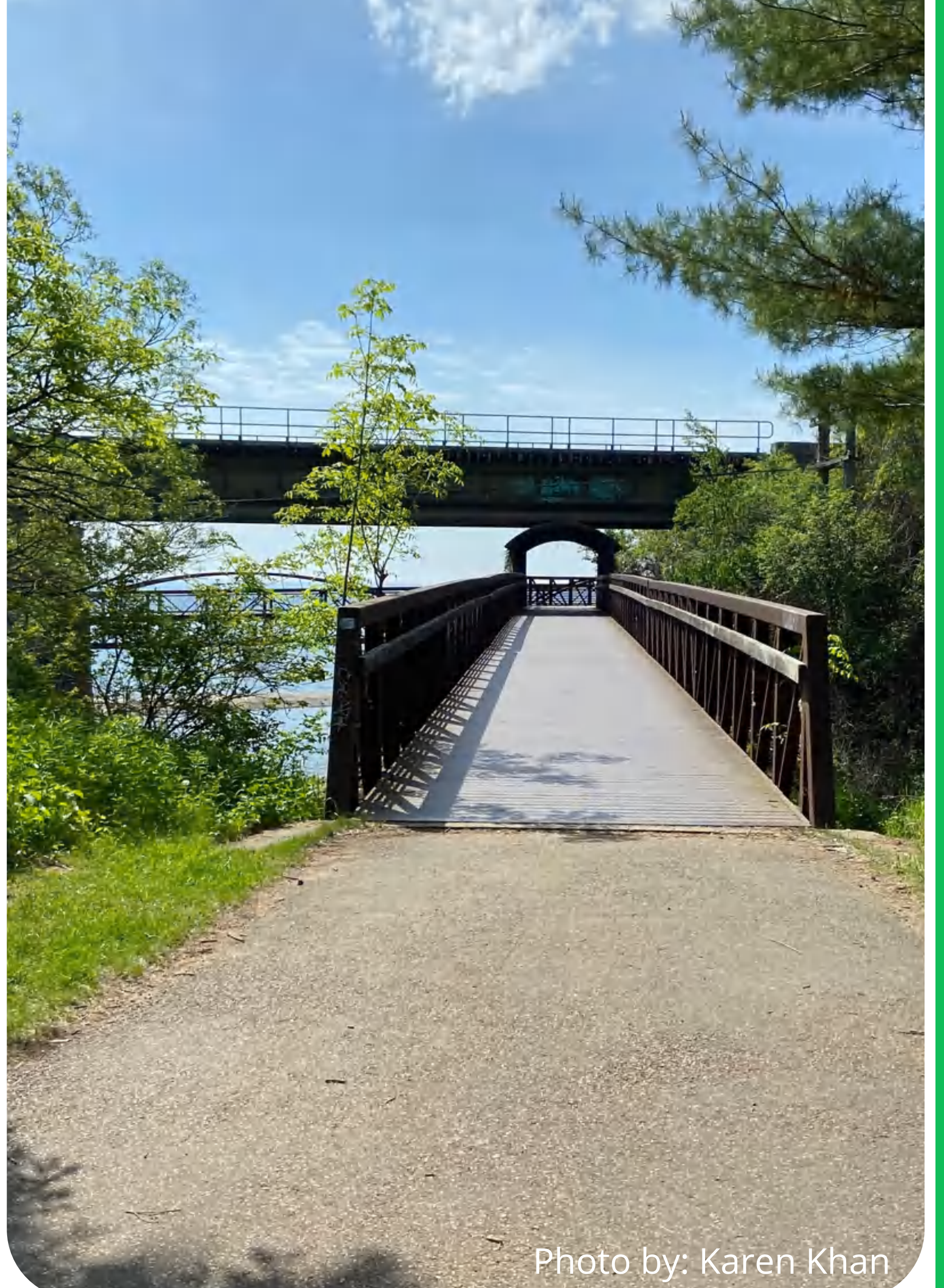
Pedestrian bridge to the Waterfront