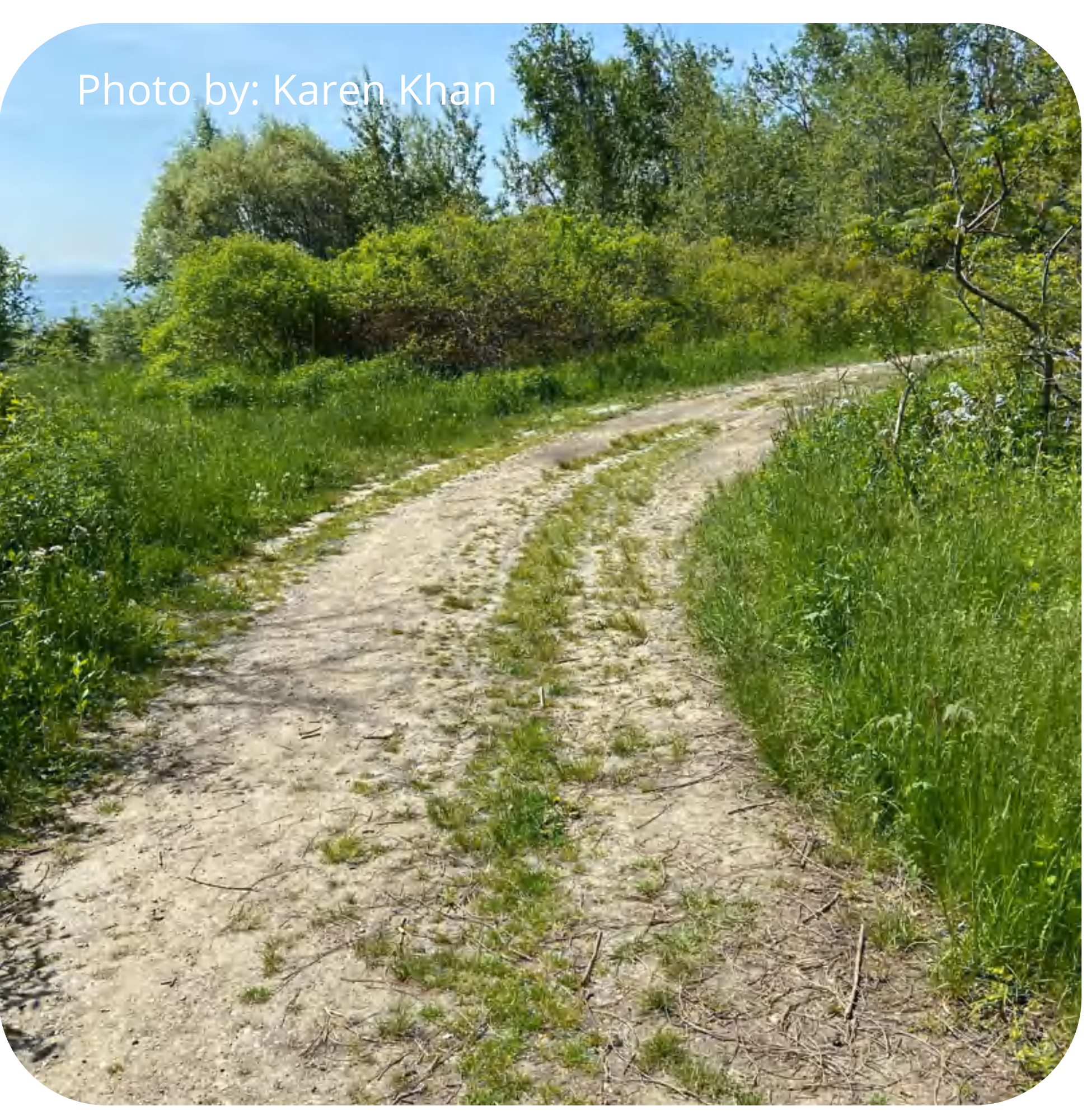
Path at East Point Park