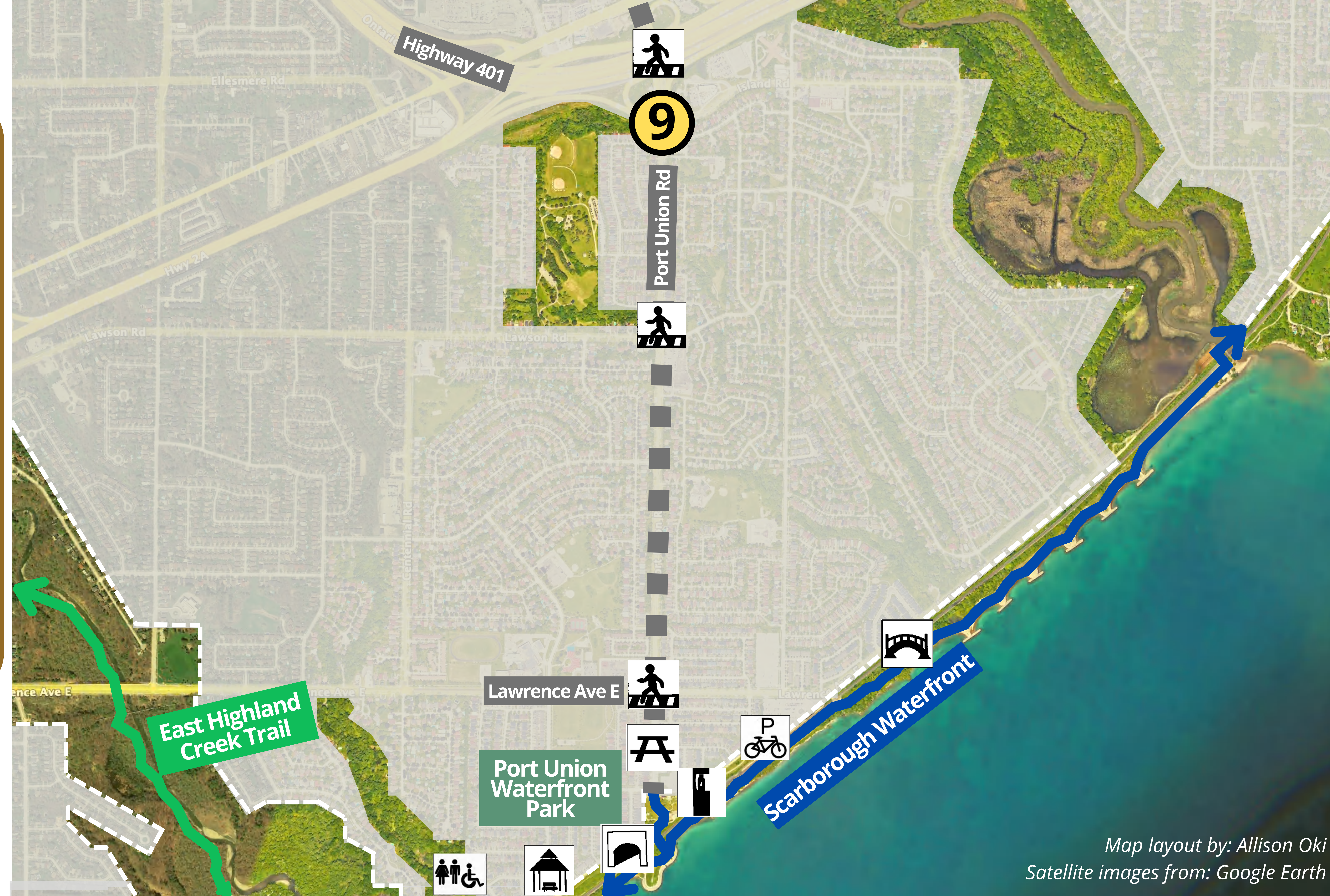
Map layout by: Allison Oki Satellite images from: Google Earth